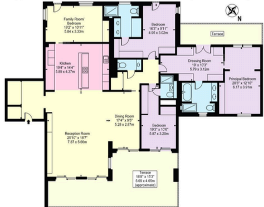
Fourth Floor For Illustration Purposes Only - Not To Scale

One Carrington Approx. Gross Internal Area 2505 Sq Ft - 232.72 Sq M Approx. External Total Area Of Terraces 645 Sq Ft - 59.92 Sq M