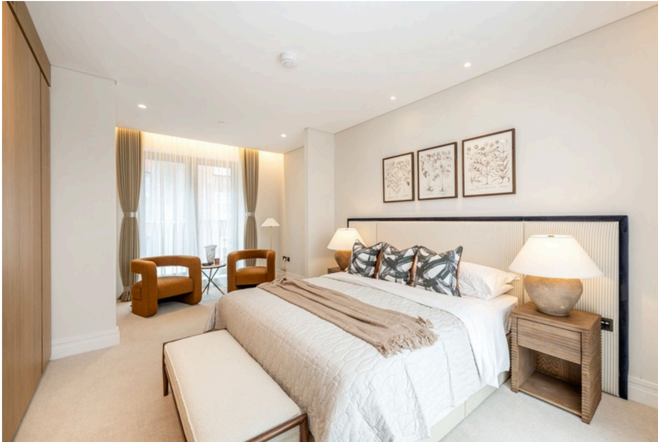
The principal bedroom leads onto the balcony.