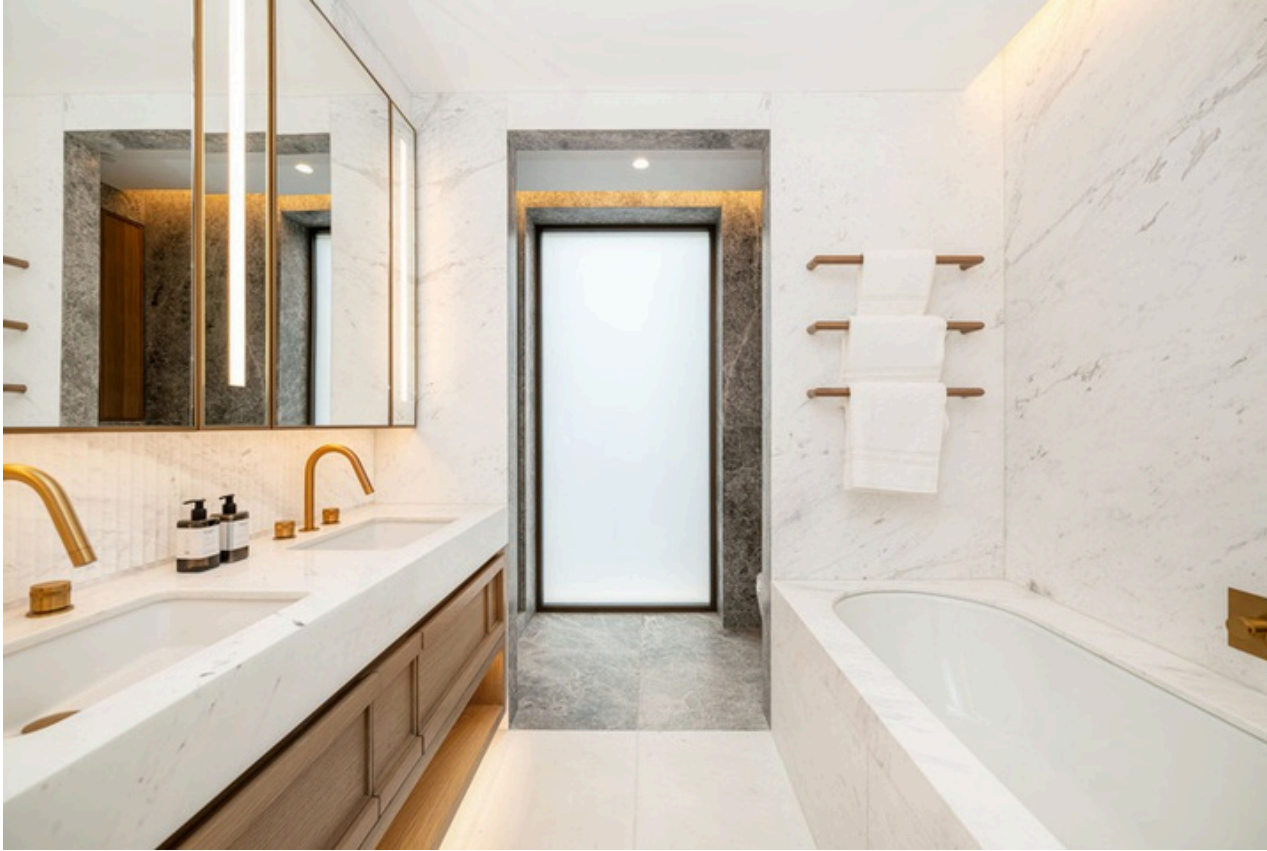
The flat benefits from three en- suite bathrooms.